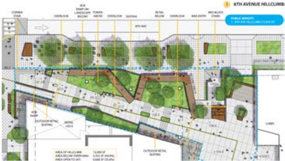
Figure 5. The proposed 8th Ave Hillclimb would provide ADA access from 8th Ave and Bell St to the mid-block connection and 7th Ave plaza.

The Commission discussed each category of public benefit. The Commissioners were supportive of the 8th Ave Hillclimb, particularly the proposed ramps that provide an accessible route to the 7th Ave plaza. They encouraged the design team to explore other opportunities along this route to accommodate additional standing or seating areas, provided that it does not affect ADA compliance. The Commission identified the landscaping in the mid-block connection as an area for further attention to ensure members of the public feel invited into and through this space.