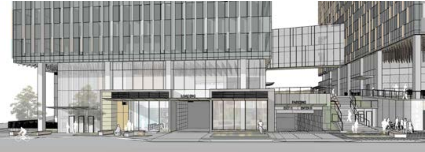
Figure 3. Revised curb cuts for vehicle and loading access on 8th Ave.