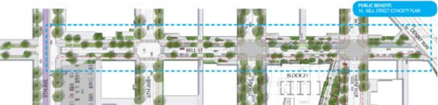
Figure 7. Proposed Bell Street Concept Plan from 5th Ave to Denny Way.

This is the final time the Commission expects to review the Block 21 alley vacation petition. Approval of both urban design merit and public benefit constitutes the Commission’s recommendation to SDOT that the vacation be granted. Ultimate the City Council makes the final decision whether to vacate the right-of-way.