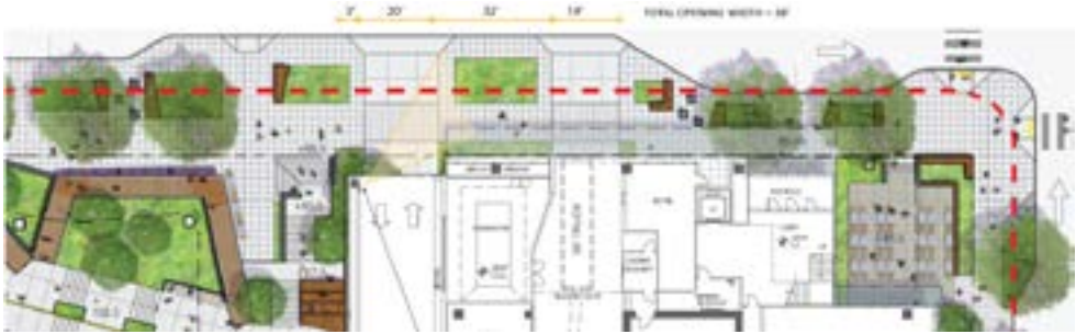
Figure 1. Updated plan for the 8th Ave streetscape, including narrower curb cuts for vehicle and loading access.

Peter Krech introduced the outline for the presentation, which is available on the Design Commission website . First, Mr. Krech addressed the outstanding condition from the Commission’s March 5 approval of urban design merit. Mr. Krech showed an update to the proposed curb cuts for vehicle and loading access on 8th Ave, as shown in Figure 1. The two 24-foot-wide curb cuts proposed on May 7 were narrowed to 20 feet for vehicles and 18 feet for loading. Mr. Krech explained that the automobile access is located away from the property line to improve the pedestrian experience, as shown in Figure 3.