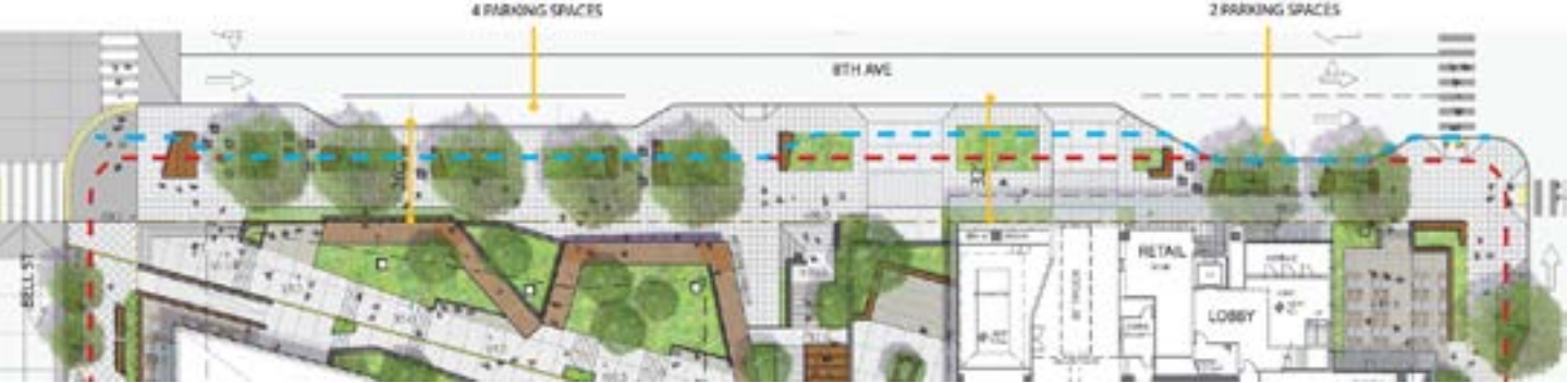
Figure 2. Revised curb line, previously proposed curb line (blue dashed line), and existing curb line (red dashed line) on 8th Ave.

The Commission emphasized its support of the proposed curb line on 8th Ave, as shown in Figure 2, and encouraged SDOT to follow through with permitting this design.