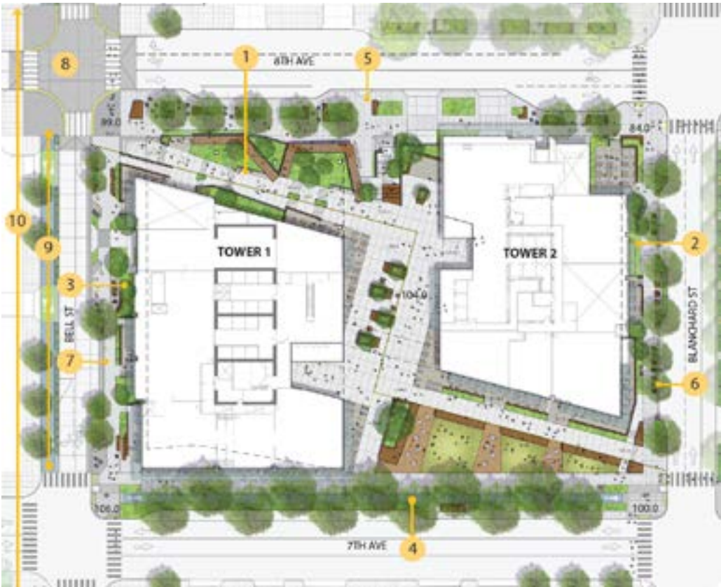
Figure 4. Proposed public benefit package. Refer to the action for the full description of each public benefit item.

Mr. Krech introduced three categories of proposed public benefit items, as shown in Figure 4.